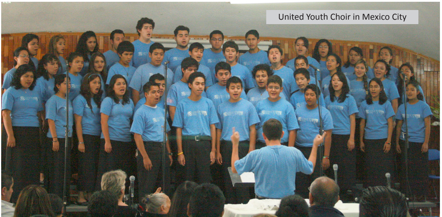
United Youth Choir in Mexico City